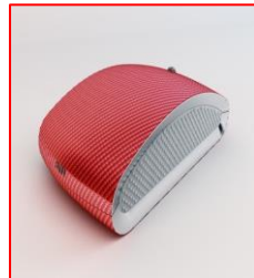
ECG ID Mouse