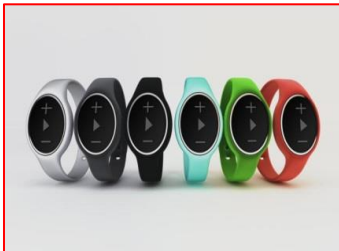
Fitness Monitor Bands